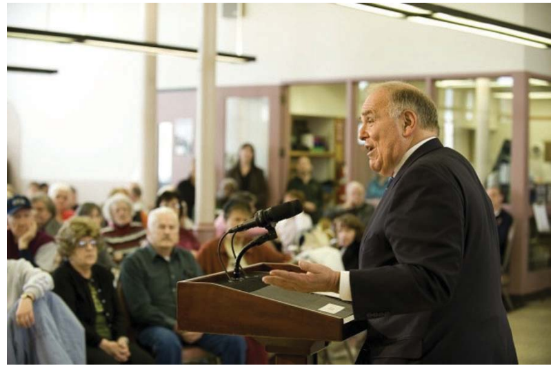
Governor Rendell announces a new round of property tax relief while visiting a senior center in Pittsburgh.

GAMING REVENUES PROVIDE $1.7 BILLION IN TAX RELIEF OVER PAST THREE YEARS