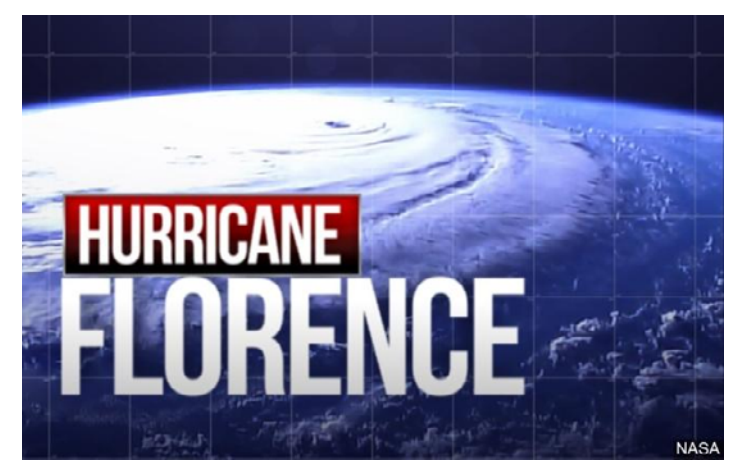
By Associated Press | Posted: Fri 5:45 AM, Sep 14, 2018 | Updated: Fri 6:11 AM, Sep 14, 2018

The IRS tax relief postpones various tax filing deadlines that occurred starting on September 7, 2018 to January 31, 2019. As a result, affected businesses will have until January 31, 2019 to file the PA-20S/PA-65 that was originally due during this period.