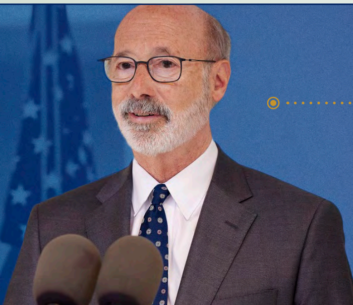
Tom Wolf, Governor